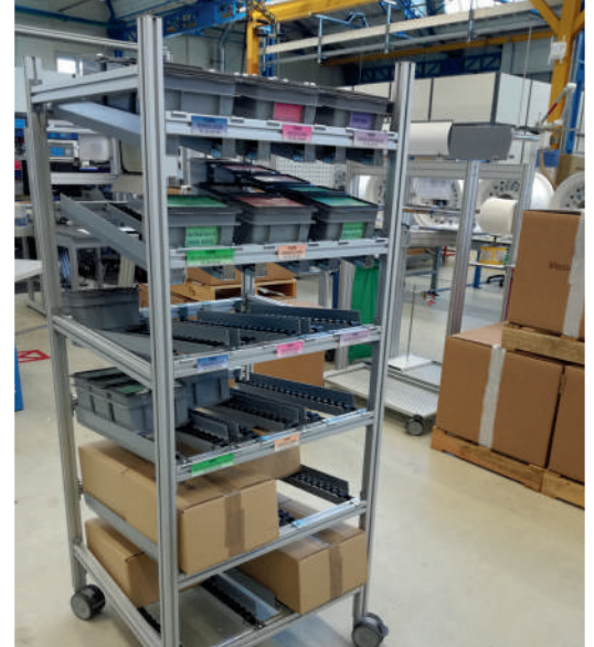
Component preparation wagon