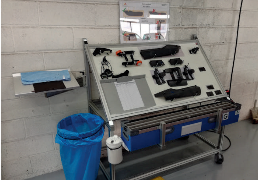
Drilling template station at line side