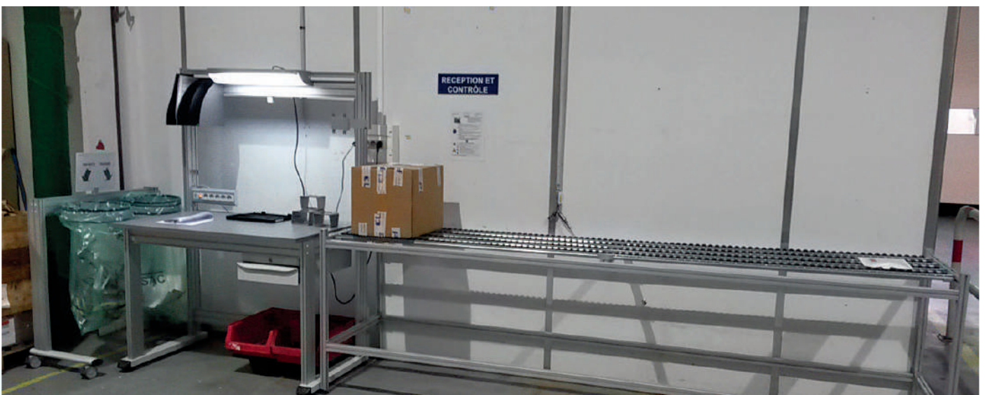
Supply of components on the workstation