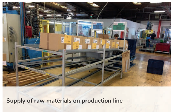
Supply of raw materials on production line