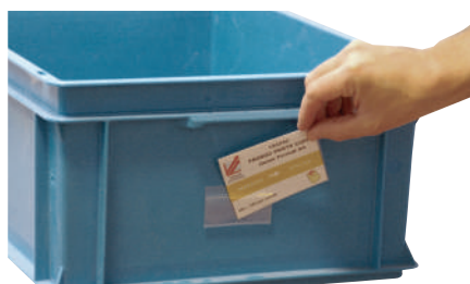
KANBAN CARD SUPPORT ADHESIVE