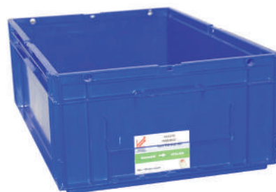
KANBAN CARD HOLDER FOR CARD ON TRAY