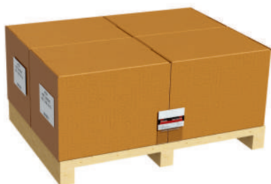
KANBAN CARD HOLDER FOR PALLET