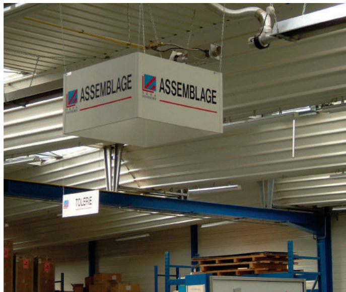
IDENTIFICATION OF A PRODUCTION AREA