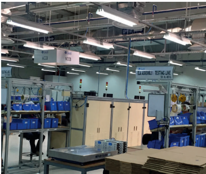
IDENTIFICATION AT THE WORKSTATION