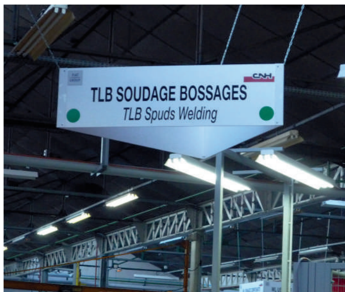
IDENTIFICATION OF PRODUCTION AREA