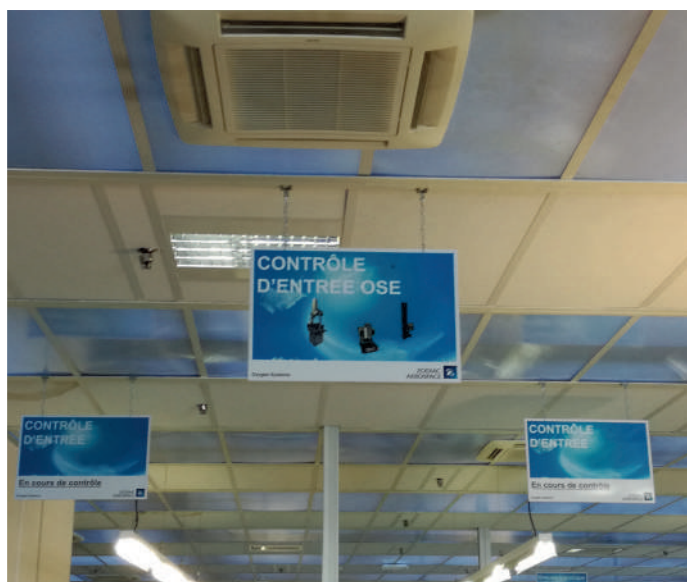
INTERNAL OVERHEAD SIGNALING