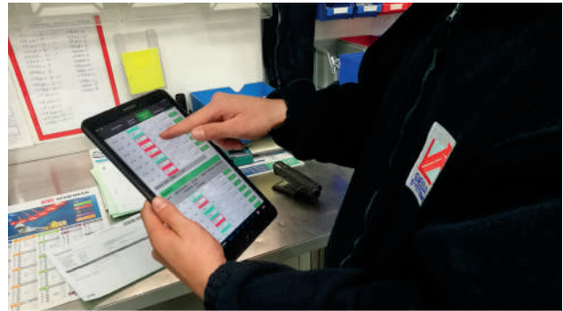
READ A NOTICE ON THE WORKSTATION