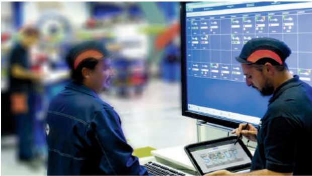
VIEW PERFORMANCE INDICATORS