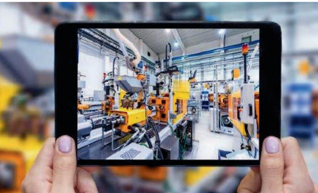
ENTER DATA INTO THE DASHBOARD