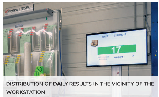
DISTRIBUTION OF DAILY RESULTS IN THE VICINITY OF THE WORKSTATION