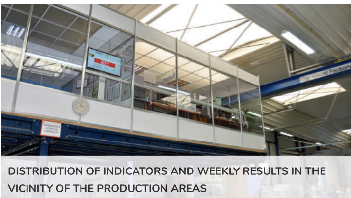
DISTRIBUTION OF INDICATORS AND WEEKLY RESULTS IN THE VICINITY OF THE PRODUCTION AREAS