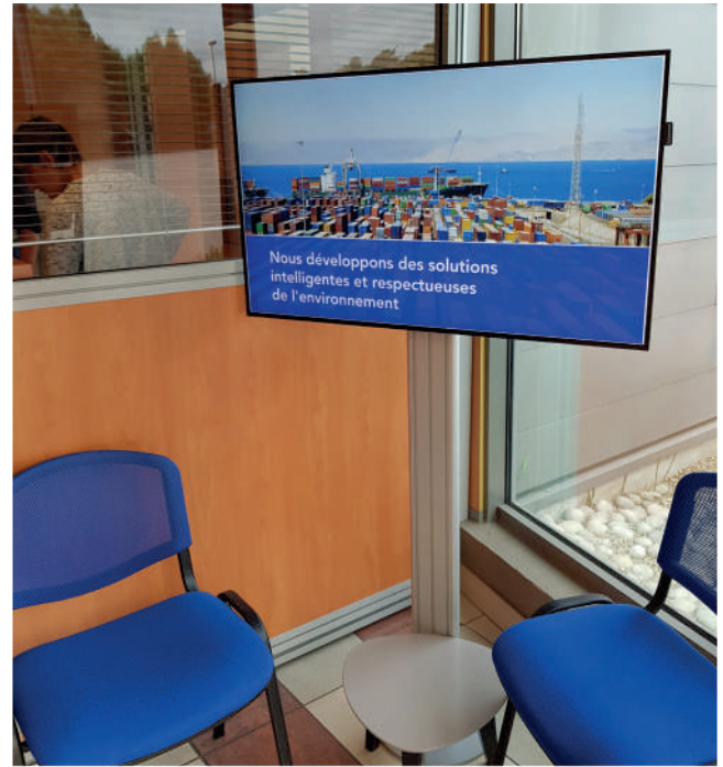
PRODUCTION INDICATORS DISTRIBUTED IN THE MEETING ROOM