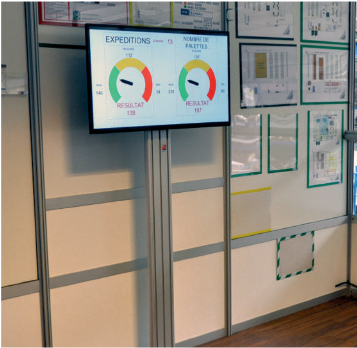
PRODUCTION INDICATORS DISTRIBUTED IN THE MEETING ROOM