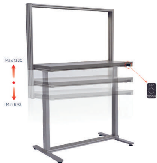
QUALIPOST 620 ERGO

Thanks to a range of modular and customisable professional furniture , the right workstation can be found for every configuration.