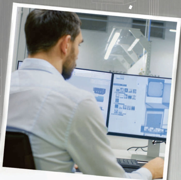
RESEARCH AND DEVELOPMENT

Last but not least is the 300 square metre SESA SYSTEMS ACADEMY , a brand new space dedicated to companies who wish to discover our products in industrial situations so that we can join forces in building the industrial company of the future type Industrie 4.0.