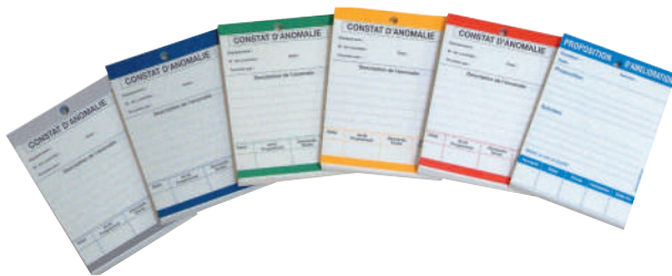
REPORT OF ANOMALY